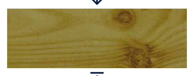
The coated aluminium