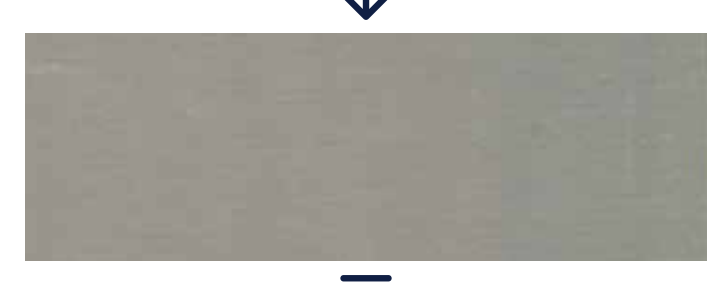
STEP 2: The aluminium is pretreated